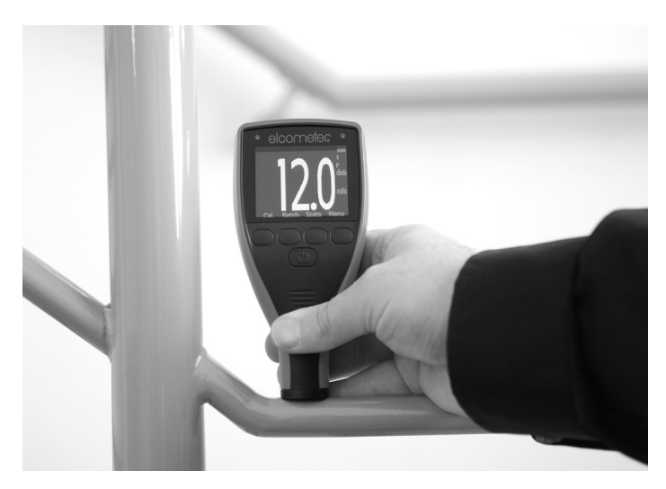
Above: Elcometer Type II Dry Film Thickness Gauge